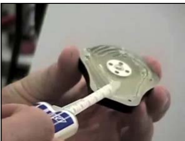
Working quickly, run a bead of Quick Adhesive around the edge of the liner attachment. Smear the bead into a thin layer on the attachment.