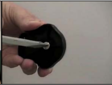
Secure liner attachment to the glue form with the finish screw.