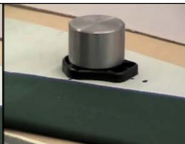
Place a small weight on top of the glue form to hold in place. Allow to set for 15 minutes.