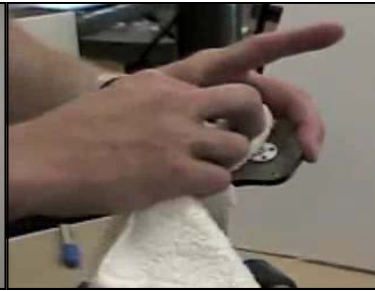
Clean the back of the liner attachment with acetone.