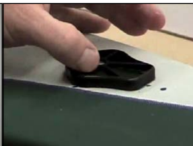
Set liner attachment in marked location.