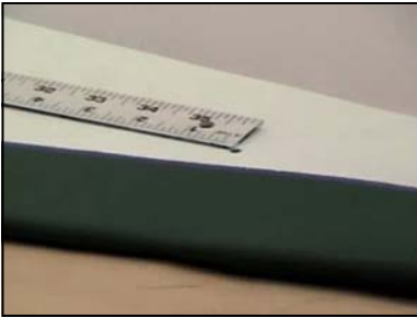
Measure 1/4" above mark on liner. This mark represents the bottom of the Manta attachment.