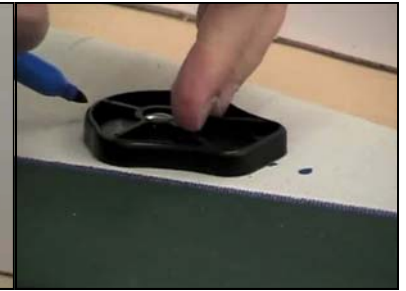
Mark around the liner attachment to ensure exact placement.