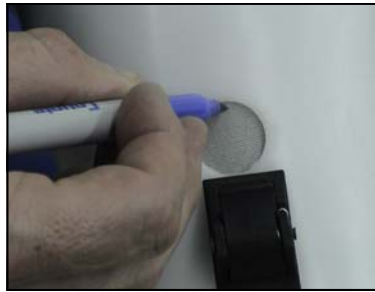
Have the patient step into socket. Mark the liner at top edge of the hole in the socket.

* CD4180 requires a dispensing gun and mix tips