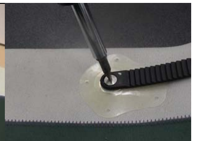
Remove the glue form and secure the tab to the liner attachment with the finish screw. Use Loctite® 242 to ensure permanent attachment.