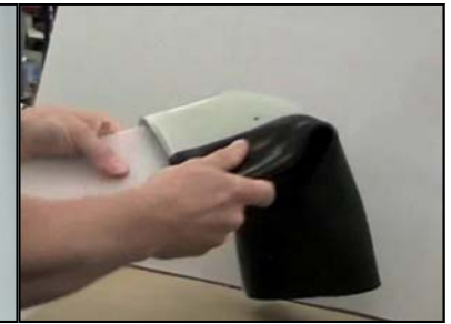
Roll liner over a piece of plastic to pre-stretch the liner and to create a flat working surface.