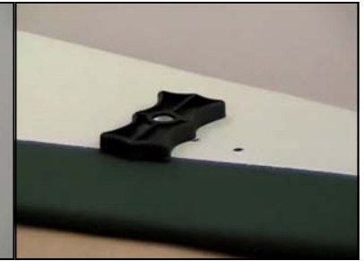
Mark around the liner attachment to ensure exact placement.