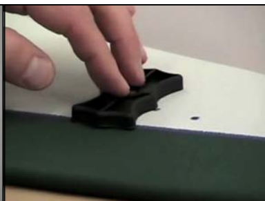
Quickly set liner attachment in marked location.