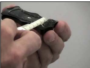
Run a bead of Quick Adhesive around the edge of the liner attachment. Smear the bead into a thin layer on the attachment.