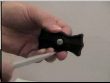
Attach liner attachment to the glue form with the finish screw.