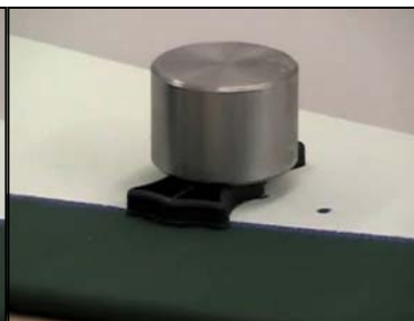
Place small weight on top of the glue form to hold in place. Allow to set for 15 minutes.