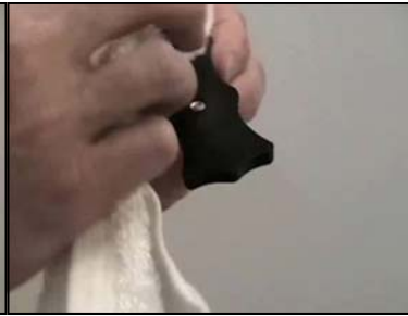
Clean the underside of the liner attachment with acetone.