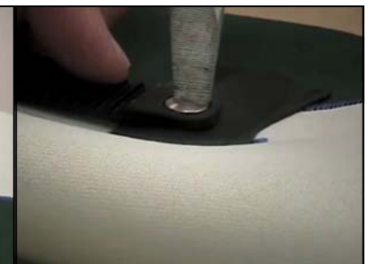
Remove the glue form and secure the tab to the liner attachment with the finish screw. Use Loctite® 242 to ensure permanent attachment.